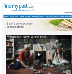
Findmypast adverts on TV

Findmypast have filmed a series of new television commercials that you'll see on the Yesterday, Watch and Blighty television channels. You can watch them all online at: www.findmypast.co.uk/video-office.jsp